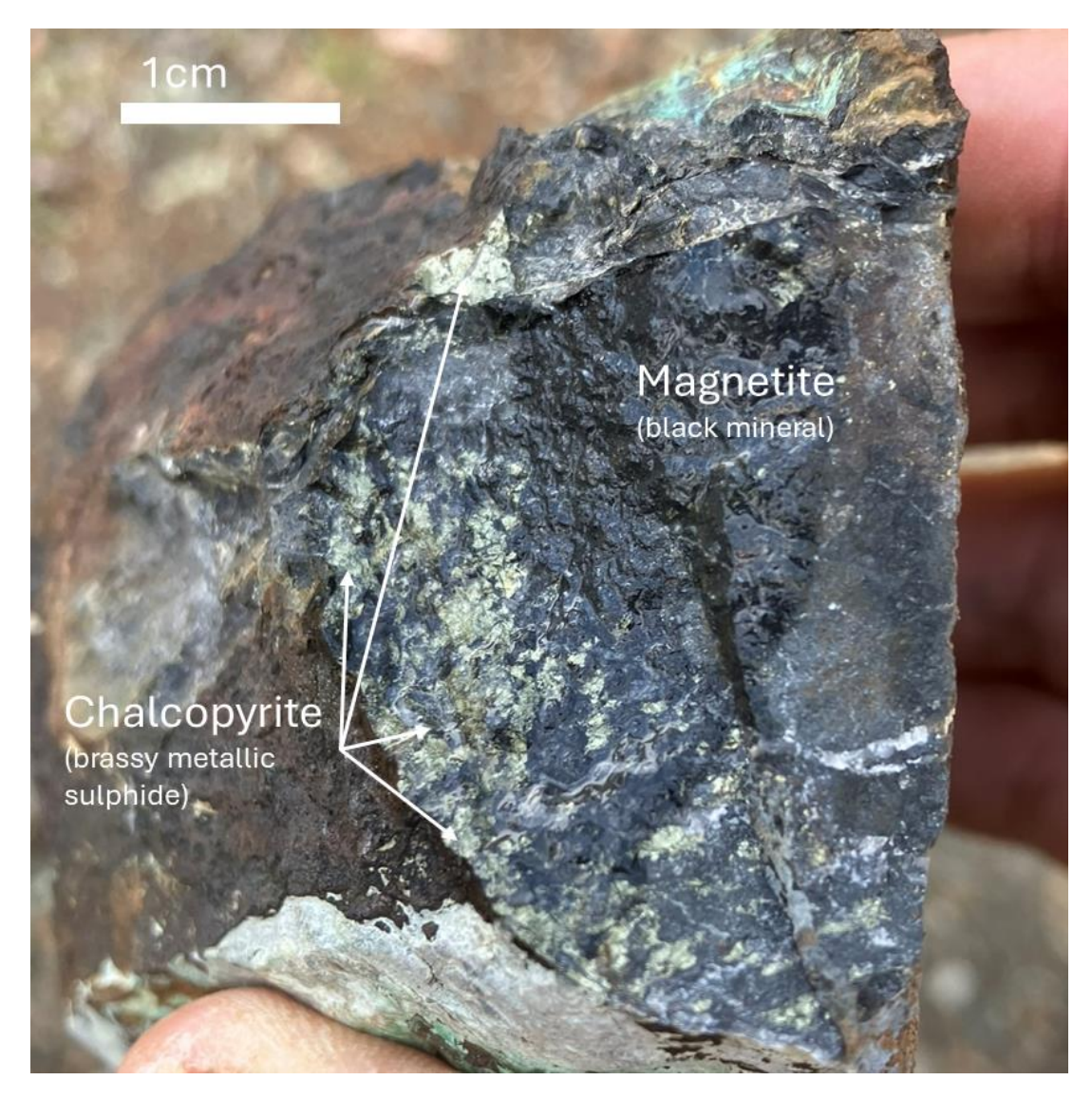
Figure 2: GC240905 - massive magnetite and chalcopyrite grading 6.49% Cu , 2.1% Zn, 28.9% Fe, 441ppm Co, 1.66g/t Ag